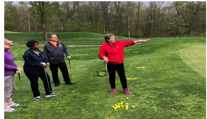
Golf Clinic & Networking – April 25, 2019 – Sunset Valley Golf Club