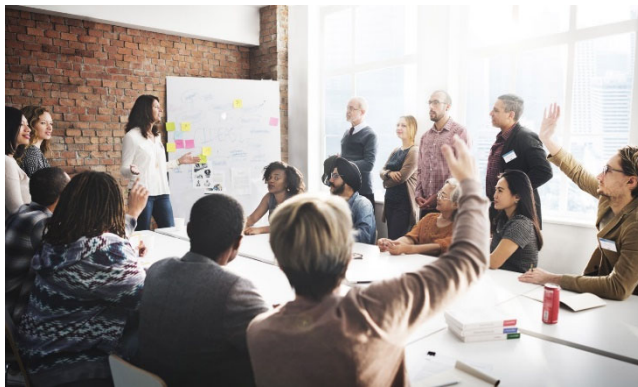
50 th Annual I-Day – November 2, 2018– The Palace at Somerset Park