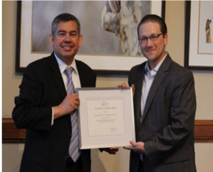
New Jersey CPCU Past Presidents/New Designee Recognition/Annual Meeting 6.6.18