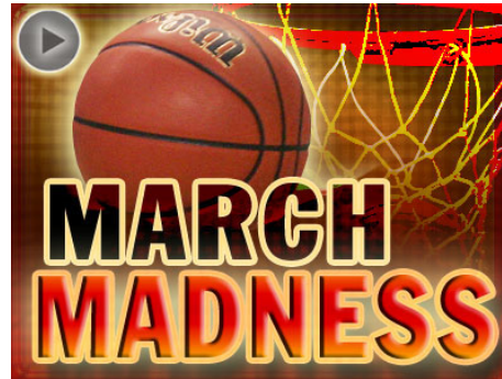
Bracket Challenge March 2019